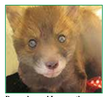
Remember me! I was on the cover of the Spring newsletter as a tiny baby. Here I am getting big and strong before my release.